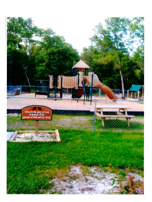
Older Children's Playground

HSE's preschool is governed by a board of church members and is located in the administration building of the church. It began with two classes of 20 students total and has evolved into a thriving school with four classes of two, three, and four year-olds with care provided before and after school hours. Children learn Spanish, sign language, chapel, and a curriculum that fully prepares them for kindergarten. Typically the school is filled to capacity of 50 children with a growing waiting list. One year-old and younger day care is needed. Growth potential is only limited by space and imagination.