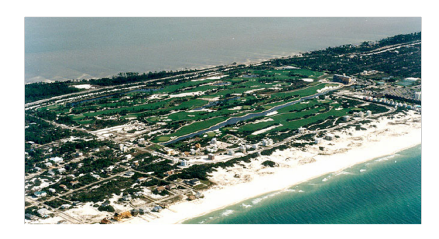
Ariel View of Paradise Island:

While the City of Gulf Shores does have lots of visitors, it does a great job of maintaining a safe and family-friendly atmosphere. The City's website has lots of good information: <a href="https://www.gulfshoresal.gov">www.gulfshoresal.gov</a>