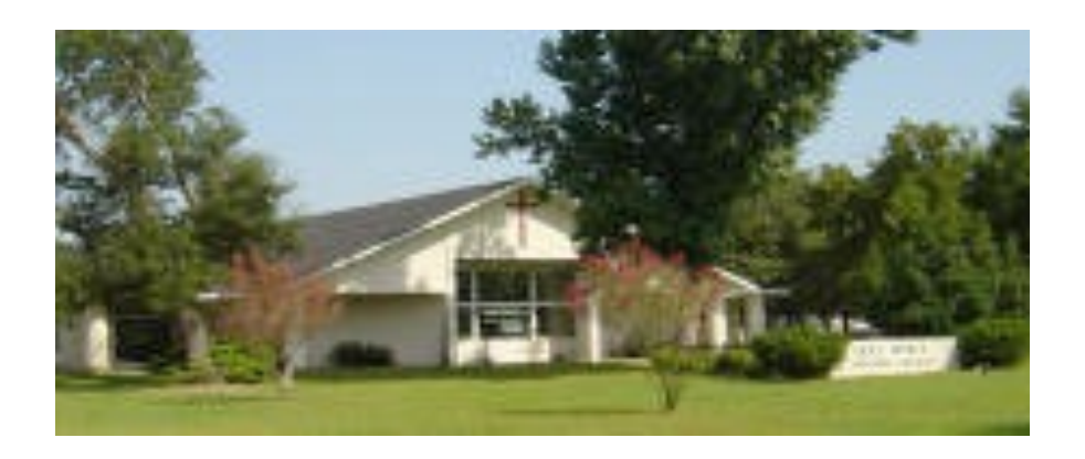
Holy Spirit Episcopal Church Gulf Shores, Alabama Parish Profile May, 2014

A Short History of Holy Spirit Episcopal Church (HSE)